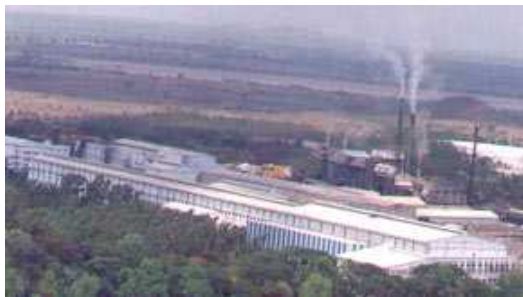
Figure 1: View of the Mill

Situated 300 km east from Hyderabad, ITC Bhadrachalam is India's largest integrated pulping and paperboard manufacturing unit. The annual pulp production of 240,000 t is made from eucalyptus, bamboo and subabul provided by ITC's plantations. Always moving forward, ITC implemented the first ozone plant for pulp bleaching in India, recently ordered a new paper machine and plans a new pulp production increase.