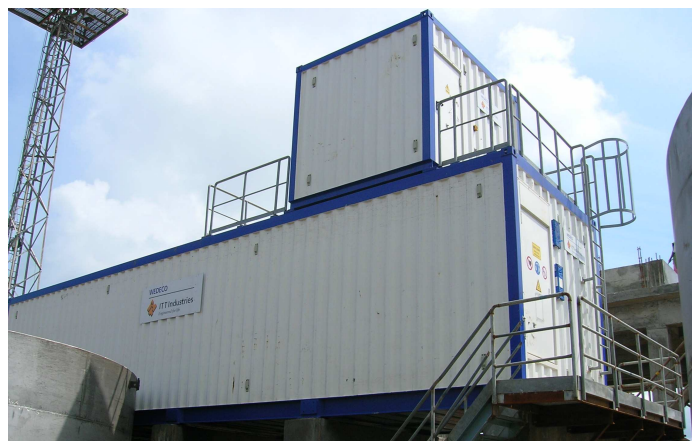
Figure 3: Worldwide largest Z-Compact System, ITC Bhadrachalam

For further information please contact: Wedeco AG · Boschstr. 4 · D-32051 Herford · Germany phone 0049 5221 930 - 0 · fax 0049 5221 930 - 249 www.wedeco.com · wedeco.de@itt.com