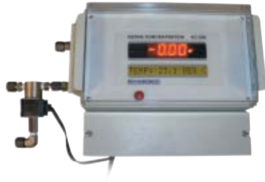
HC-500 ozone monitor

A PLC takes care of the monitoring and control of all key operation parameters. Smooth variation of the amount of ozone produced (from 10 to 100%) and of the ozone concentration is possible. The systems can thus be adjusted precisely to changed operating conditions. Customer-specific system control requirements, e.g. control through process variables (water flow volume, etc.), can be satisfied without any difficulty.