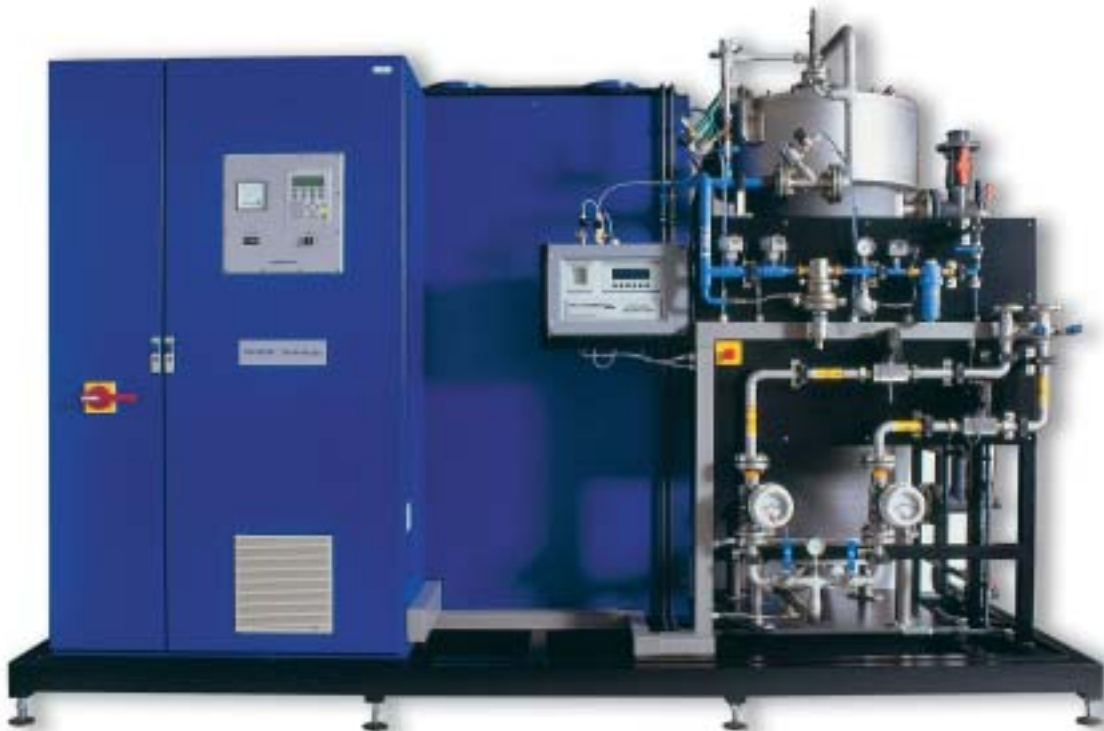
SMO-type ozone system with optional dual gas distribution and operation panel